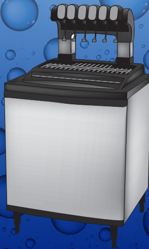
Soft Drink Dispenser