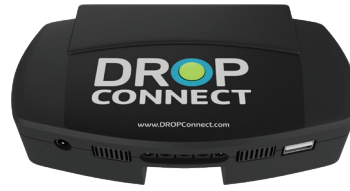
DROP Hub Status Light Green Connected to WiFi Only