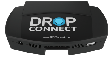
DROP Hub Status Light Blue Connected to WiFi and DROP Connect Services