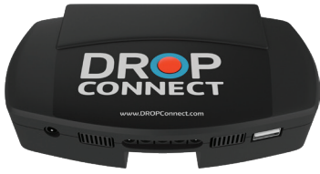
DROP Hub Status Light Red Lost WiFi Signal

Similar to the mobile setup process, DROP can operate in any network environment, with or without WiFi. The color of your DROP Hub light will indicate to you what connection mode it is in. Here is an overview of each of color modes.